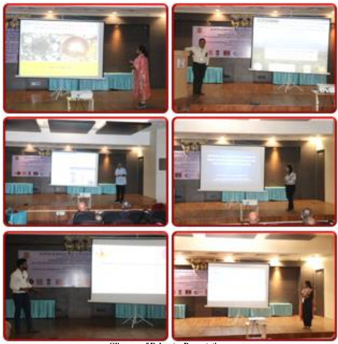
Glimpses of Delegates Presentation